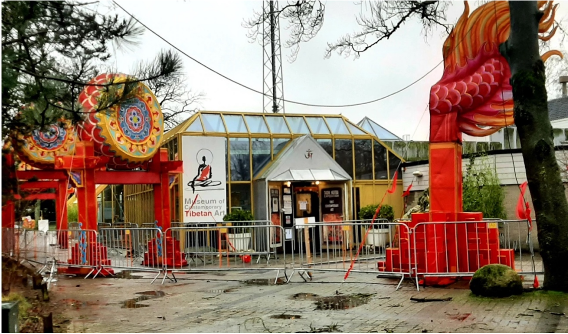
Febr. 2022. Picture of our museum under the China Lights exhibition, which had happened in the Renssenpark, where the MoCTA is located.