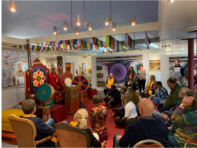
Meditation session in the presence of the Mayor of the Municipality of Emmen and his wife in the Gallery space of the Museum