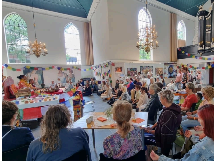
Tibetan Healing Festival 2022 at “Groke kert”

Walking Meditation is happening and Participants walk through the Emmer Forest. All have a lunch provided by Eco Plaza, who are benefactors of our Museum.